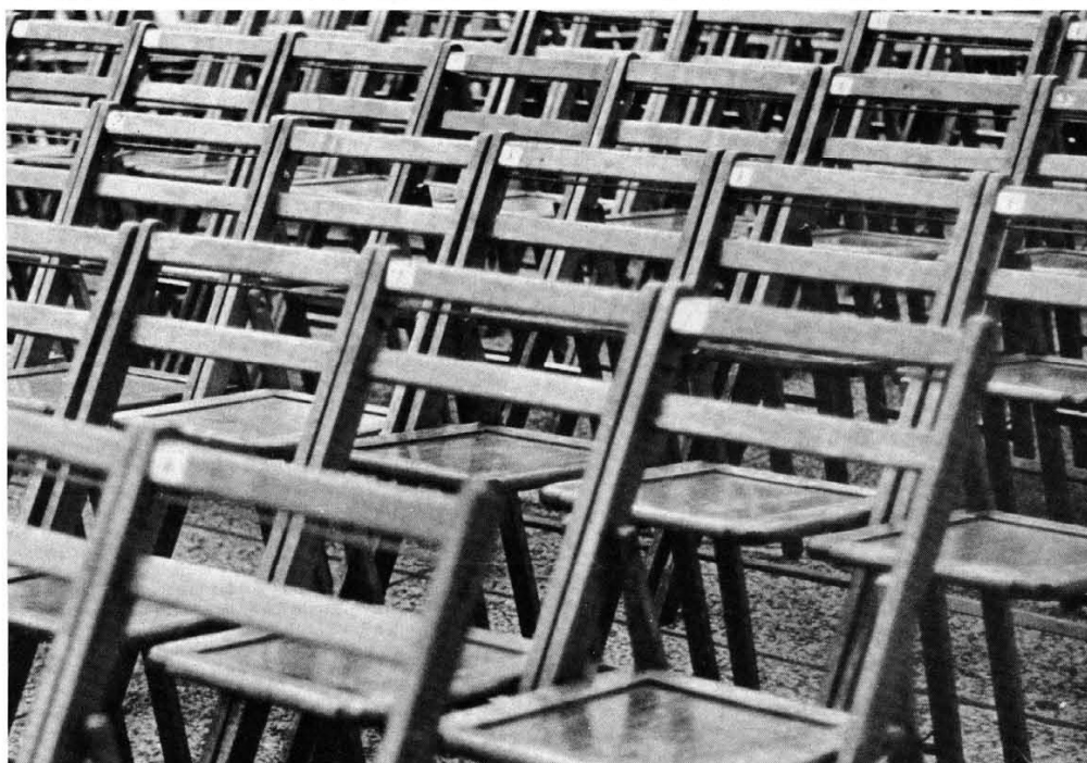
Fratnites: The Graduation of Vacant Minds